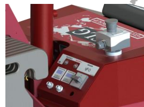
GLG built-in vacuum system